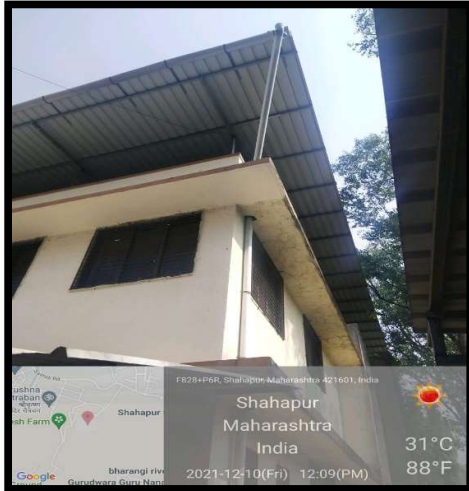
Rain water harvesting