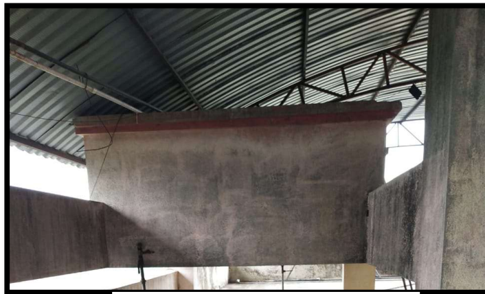
Construction of tanks