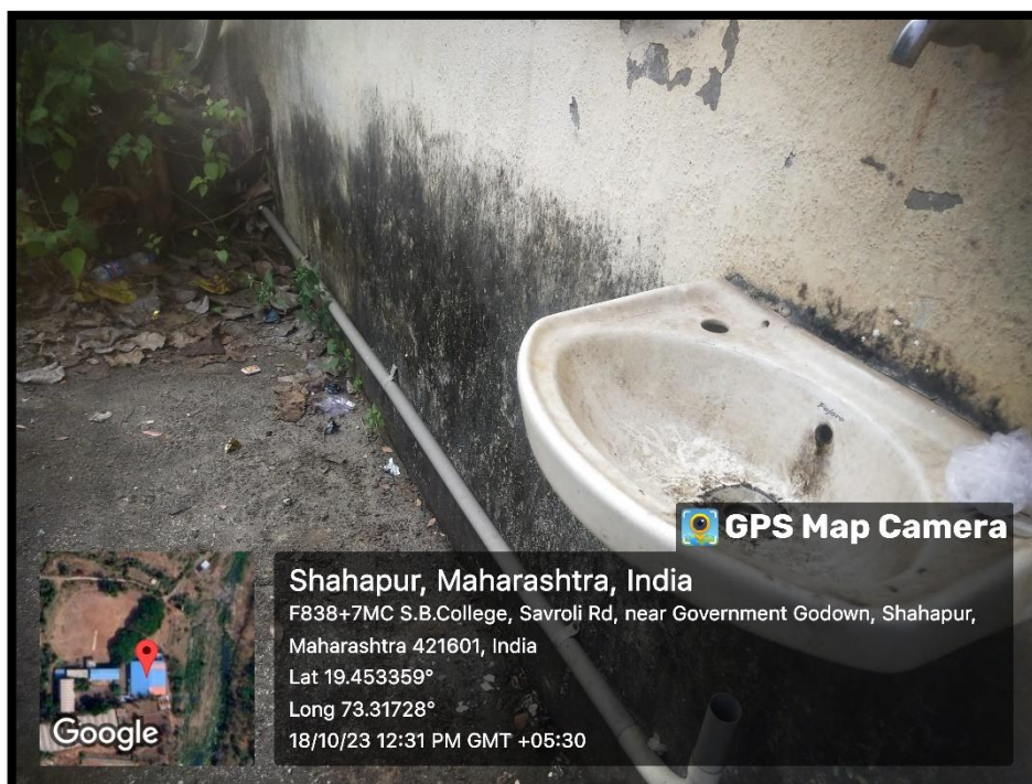
Water waste from the canteen redirected to the plants